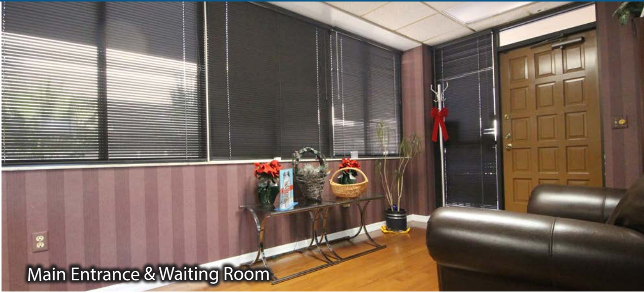
Main Entrance & Waiting Room