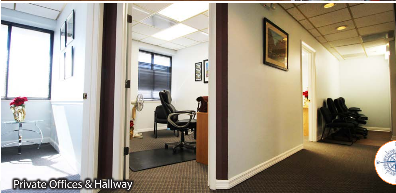
Private Offices & Hallway